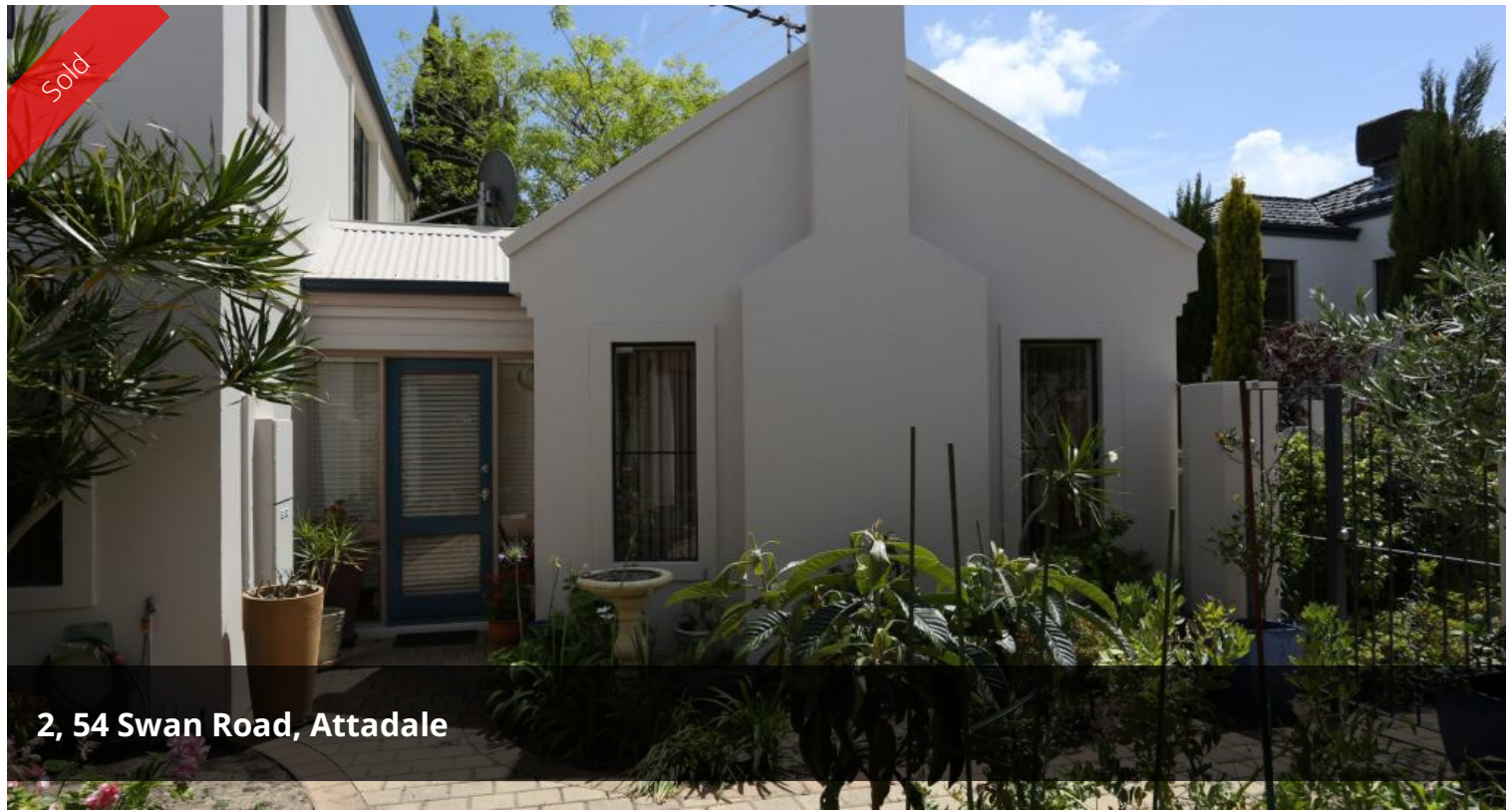
2, 54 Swan Road, Attadale