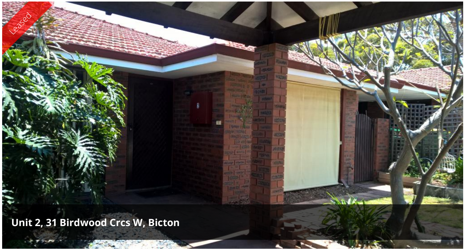
Unit 2, 31 Birdwood Cres W, Bicton